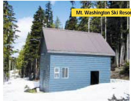
Mt. Washington Ski Resort

T he EOCP Board was well represented at a training, education and certification workshop held in Toronto, September 25-28, 2002, which was sponsored by Canadian Water and Waste Association (CWWA), Health Canada, Canadian Council of Ministers of the Environment (CCME), and the Ontario Ministry of the Environment. The goal of the workshop, which was attended by close to 50 representatives from federal, provincial, territorial, First Nations, and professional groups, was to develop a national path forward to ensure the consistency and adequacy of training programs for all of Canada. Since the recent incidents related to contaminated drinking water in Ontario and Saskatchewan, authorities across the country are reassessing their strategies for water and wastewater management. Part of this reassessment, is a review of certification requirements for water and wastewater operators country-