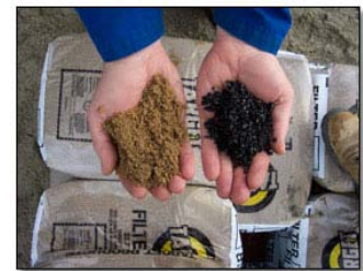
Sand and anthracite filter media

Soda ash is also injected in the effluent chamber once the treatment process is complete, again to raise the pH of the treated water.