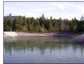
Backwash settling pond

The Chapman Creek Water Treatment Plant was commissioned in March 2004, supplying safe and excellent quality water to Sunshine Coast residents and visitors.