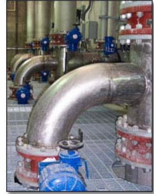
Treated water pipe gallery

Two new standby diesel generators are available for automatic switchover in case of a power outage. A 450 kW generator powers the main plant with a 100 kW unit powering the raw water pump station. An existing 35 kW generator powers the chlorine building in case of a power outage.