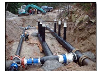
Underground piping for the raw water pump station