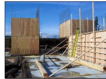
Formwork for the filters

The water treatment plant process consists of chemical injection and rapid mixing, coagulation and flocculation, clarifying by flotation, filtration and disinfection. Treated water is discharged into the adjoining reservoir prior to entering the distribution system.