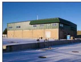
Water treatment plant main building

The Chapman Creek Water Treatment Plant was commissioned in March 2004, supplying safe and excellent quality water to Sunshine Coast residents and visitors. Don Gare - SCRD