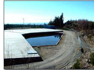
Site of the new water treatment plant

The Sunshine Coast Regional District (SCRD) is located 40 minutes by ferry northwest of Vancouver on the beautiful Sunshine Coast. The SCRCD supplies water to residents with five separate water systems consisting of seven supply sources. The largest system is the Chapman Creek system which supplies water to 22,000 residents in Sechelt and adjoining rural areas.