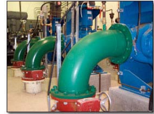
Raw water pumps

The treatment process produces sludge from the removal of colour and turbidity in the DAF and filter processes. Floc from the DAF process and backwash waste from the filters is flushed by gravity to the old open water reservoir 1.5 km from the water treatment plant. The old reservoir was converted to a sludge settling basin where the water is decanted and piped to an adjacent gravel and sand operation.