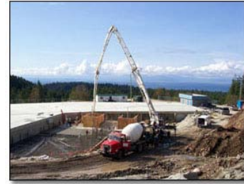
Early in the construction

This pumping station consists of three low lift pumps which supply all the flow to the new treatment plant. Each pump has a capacity of 16 ML/day and operates on variable speed drives. Two pumps only can operate together. The raw water is pumped to the main treatment plant building which is adjacent to the existing 13 ML Selma Zone 2 reservoir.